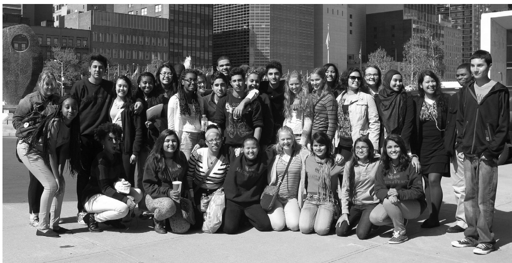
A contingent of nearly 30 young adults who are members of the Syracuse Chapter of Seeds of Peace traveled to the United Nations in September to celebrate the International Day of Peace and share Syracuse peace activities with 500 students from around the world. Accompanied by InterFaith Works' staff and members of Women Transcending Boundaries, the group was photographed at the United Nations Plaza in New York City.