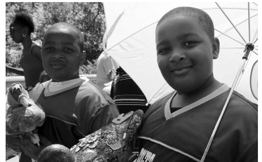
The Center for Dialogue organized the annual Duck Race to End Racism held in June at the Syracuse Inner Harbor. Thousands of people participated in the fun-filled family event that raises awareness about racism and racial inequality.