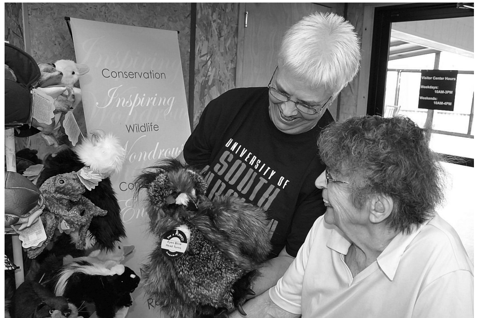
InterFaith Works' senior companions provide both friendship and the assistance needed to help their clients live independently at home. Admiring a stuffed owl at Montezuma National Wildlife Refuge are a senior companion and her client, both of whom share a love for the bird of prey.